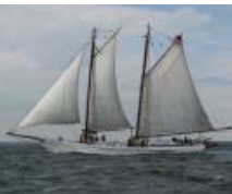
A.J. MEERWALD , Bivalve, New Jersey Two-Masted Oyster Schooner, 115' sparred length, 22' beam, 57 gross tons Owner- The Bayshore Discovery Project

The square topsail schooner Lynx has been designed and built to interpret the general configuration and operation of a privateer schooner from the War of 1812. Lynx sails as a living history museum and as a floating classroom for the study of historical, environmental and ecological issues. This is Lynx's first visit to Chestertown and Downrigging Weekend.