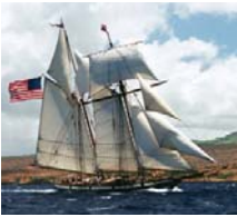
LYNX , Newport Beach, California Square Topsail Schooner, 122' sparred length, 23' beam, 94 gross tons Owner - Lynx Educational Foundation

Pride of Baltimore, II was commissioned in 1988 two years after the original Pride of Baltimore fell victim to a violent squall and was lost along with her captain and three crew members. Modeled after the famous Baltimore clippers, Pride II sails the globe as Maryland's goodwill ambassador.