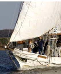
SKIPJACK ELSWORTH , Chestertown, Maryland Two-Sailed Bateau (skipjack), 72' sparred length, 18' beam, 23 gross tons Owner - Echo Hill Outdoor School, www.ehos.org

Sultana is a reproduction of her 1768 namesake used by the British Royal Navy to enforce the notorious tea taxes in the years preceding the American Revolution. Built in Chestertown and launched in 2001, the new Sultana's mission is to educate students of all ages about the history and ecology of the Chesapeake Bay.