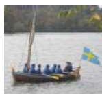
LITTLE KEY Wilmington, Delaware Replica 17th Century Shallop, 28' LOA Owner - Kalmar Nyckel Foundation