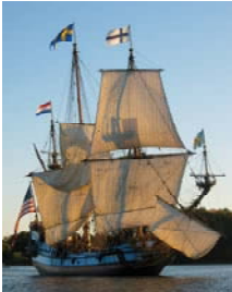
KALMAR NYCKEL , Wilmington, Delaware Full-rigged ship, 141' sparred length, 25' beam, 168 gross tons Owner - Kalmar Nyckel Foundation, www.kalmarnyckel.org

The Kalmar Nyckel is a re-creation of the first colonial Swedish settlement ship to arrive in America at what is now Wilmington, Delaware. Launched in the Fall of 1997, this ornately carved 17th century reproduction ship sails seasonally, carrying out her mission of goodwill, providing hands-on educational opportunities for school children and serving as Delaware's official tall ship ambassador.