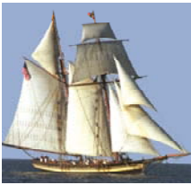
PRIDE OF BALTIMORE, II , Baltimore, Maryland Square Topsail Schooner, two masted, 170' sparred length, 26' beam, 97 gross tons Owner - Pride of Baltimore, Inc., www.pride2.org

The Kalmar Nyckel is a re-creation of the first colonial Swedish settlement ship to arrive in America at what is now Wilmington, Delaware. Launched in the Fall of 1997, this ornately carved 17th century reproduction ship sails seasonally, carrying out her mission of goodwill, providing hands-on educational opportunities for school children and serving as Delaware's official tall ship ambassador.