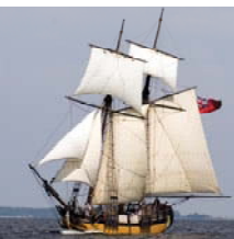
SULTANA , Chestertown, Maryland Square Topsail Schooner, two masts, 97' sparred length, 17' beam, 43 gross tons Owner - Sultana Projects, Inc., www.schoonersultana.com

Built in Dorchester, New Jersey, in 1928, the A.J. Meerwald is an authentic, restored Delaware Bay oyster schooner built specifically for that industry. Named New Jersey's official Tall Ship in 1998, the A.J. Meerwald promotes Delaware Bay's oystering history and offers experiential educational opportunities throughout Delaware Bay and the Mid-Atlantic region.