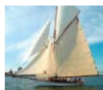
ELF Earleville, Maryland 1888 Cutter, 68' LOA Owner - Classic Yacht Restoration Guild